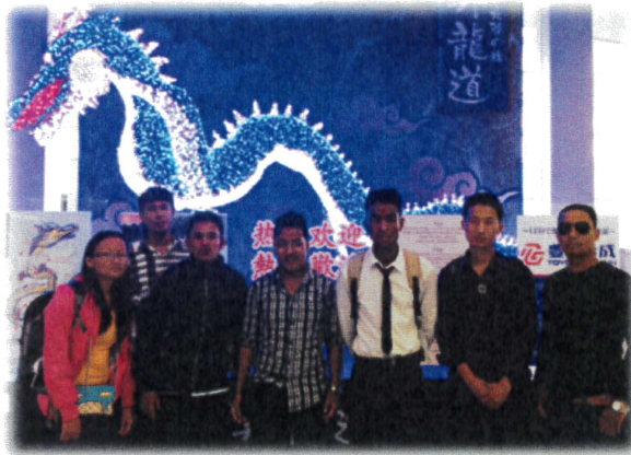
(1st UIS students arrival in Japan)