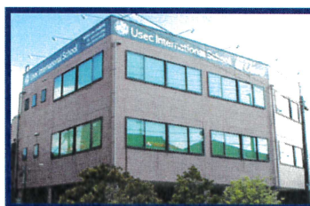
Outside appearance of school

※4 classrooms Each room can accommodate 20 people.